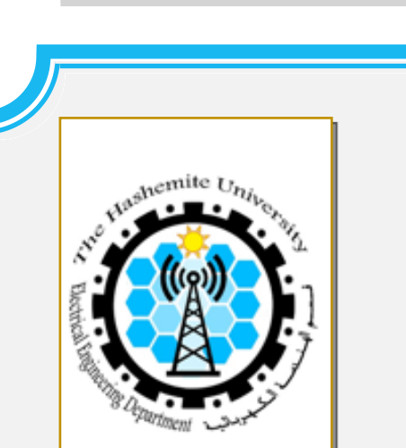
Tassniem Hussain Omari